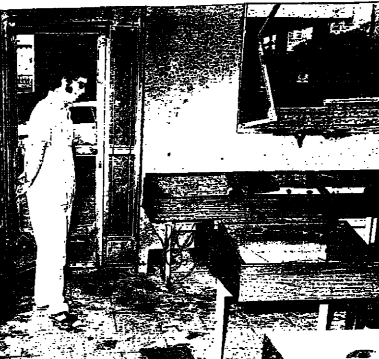
Man gets 3 years for instalment swindles

Man gets 3 years for instalment swindles TEL AVIV. — A 24-year-old member of a gang that swindled television set dealers in an instalment racket was sentenced yesterday to three years' imprisonment.